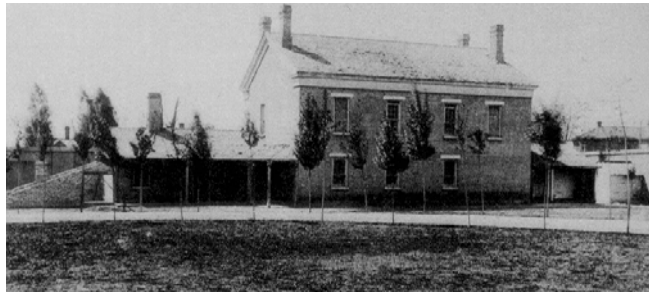
Endowment House Salt Lake City