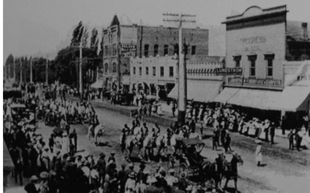
1907. The circus traveling down Main Street in Logan. Notice the electric lines on poles down the middle of the street.