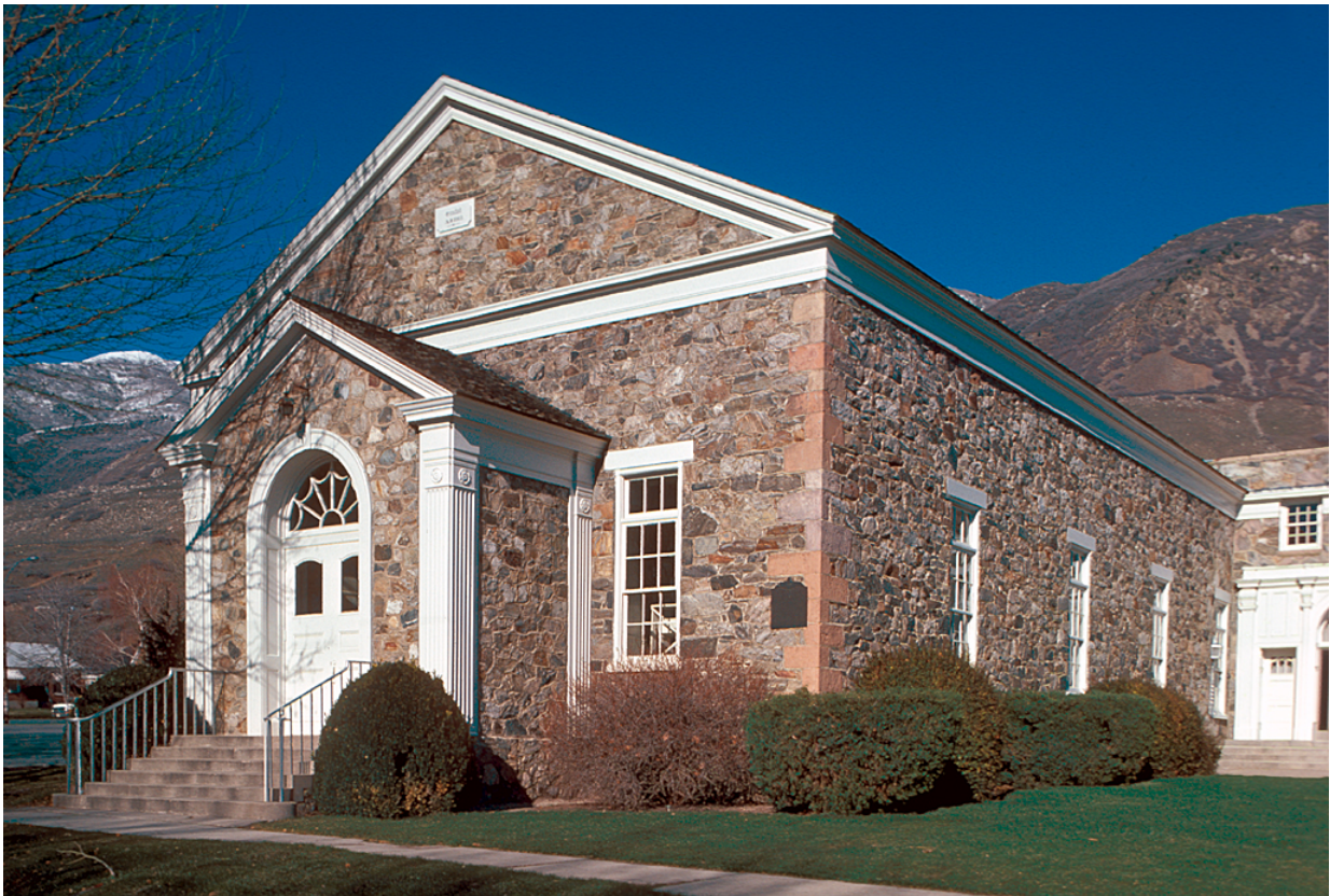
Farmington Rock Chapel – Site of First Primary

Sabrina and Lisbon’s children were among those who attended the first primary.