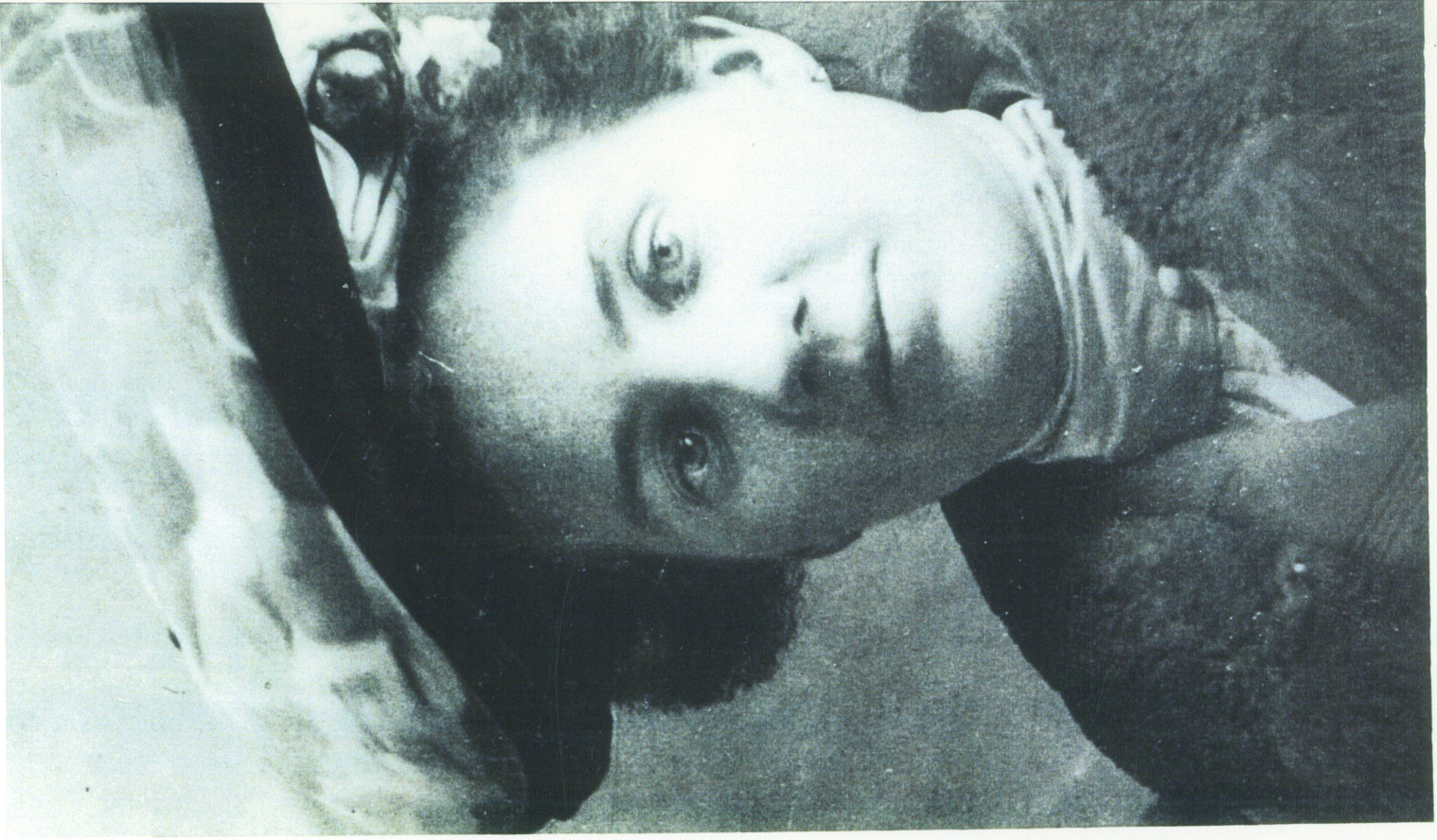
Mother and Grandmother