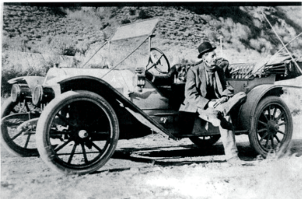
Logan Library Special Collections: 721 Box A1 fd 8

Source: Raymond C. Somers' Historical Photographs, Logan Library's Special Collections.