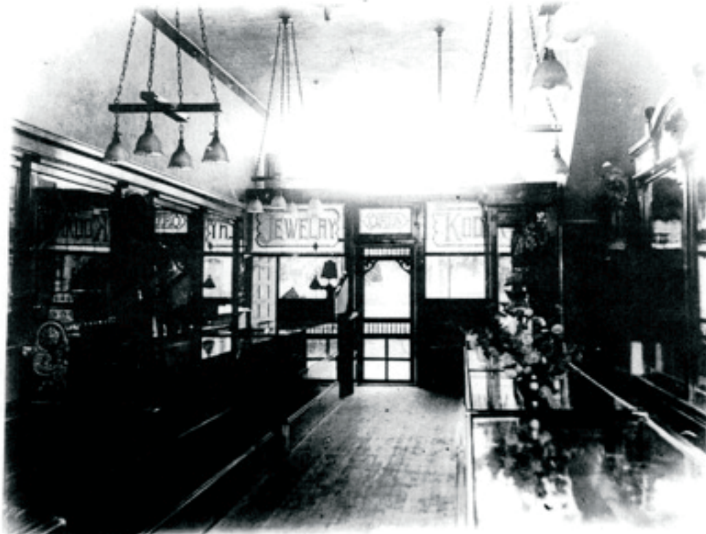
Logan Library Special Collections: 721 Box F1 fd 7